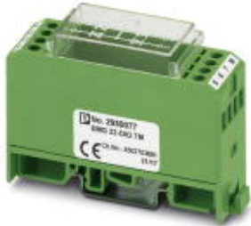
Diode module, with 7 diodes, common anode, diode type 1N 4007

Please be informed that the data shown in this PDF Document is generated from our Online Catalog. Please find the complete data in the user's documentation. Our General Terms of Use for Downloads are valid ( http://phoenixcontact.com/download )