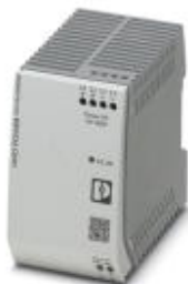
Primary-switched UNO POWER power supply for DIN rail mounting, input: 1-phase, output: 15 V DC/100 W

Please be informed that the data shown in this PDF Document is generated from our Online Catalog. Please find the complete data in the user's documentation. Our General Terms of Use for Downloads are valid ( http://phoenixcontact.com/download )