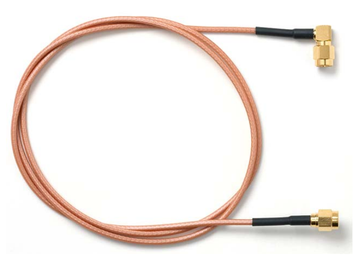
Model 73069 SMA Plug to SMA Right-Angle Plug, RG316/U