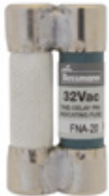
32Vac 20 to 30A