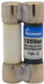
125Vac 12 to 15A