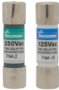
250Vac 1/10 to 6A 125Vac 6-1/4 to 10A