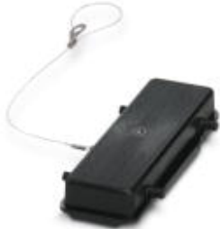
HEAVYCON protective cover, B24, for HC-EVO-B24... supporting base element, for double locking latch, with retaining cord with combination eyelet, IP54

Please be informed that the data shown in this PDF Document is generated from our Online Catalog. Please find the complete data in the user's documentation. Our General Terms of Use for Downloads are valid ( http://phoenixcontact.com/download )