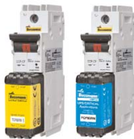
CCP_CF 1-, 2- & 3-Pole switched disconnects Data Sheet 1157