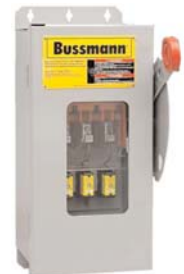
CF_ Quik-Spec™ Safety Switch disconnect (optional window). Data Sheet 1156

The only controlled copy of this Data Sheet is the electronic read-only version located on the Cooper Bussmann Network Drive. All other copies of this document are by definition uncontrolled. This bulletin is intended to clearly present comprehensive product data and provide technical information that will help the end user with design applications. Cooper Bussmann reserves the right, without notice, to change design or construction of any products and to discontinue or limit distribution of any products. Cooper Bussmann also reserves the right to change or update, without notice, any technical information contained in this bulletin. Once a product has been selected, it should be tested by the user in all possible applications.