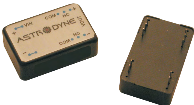
Unit measures 0.8"W x 1.25"L x 0.5"H