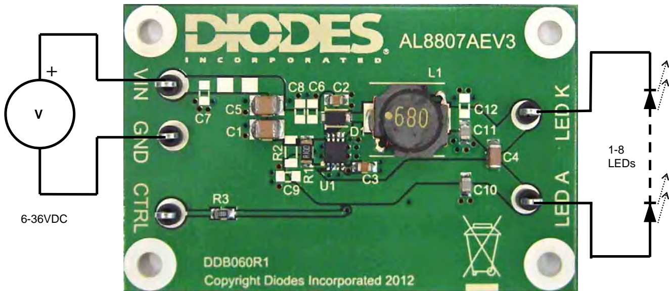
Figure 1: AL8807AEV3 evaluation board and connection diagram

Warning: At 36V nominal operation with 1A output, the LED will be hot and very bright