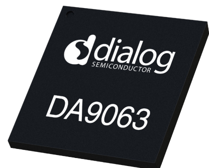
Available in 100 VFBGA 8 mm x 8 mm x 1 mm, 0.8 mm pitch

The low-power Real Time Clock (RTC) with an external crystal oscillator provides time-keeping, alarm and wakeup functions. In addition, a watchdog timer is included for system monitoring purposes.