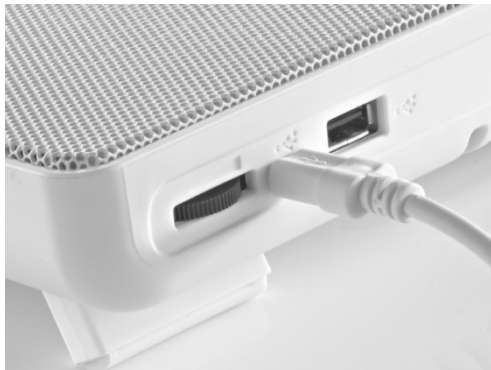
Fan Speed Dial