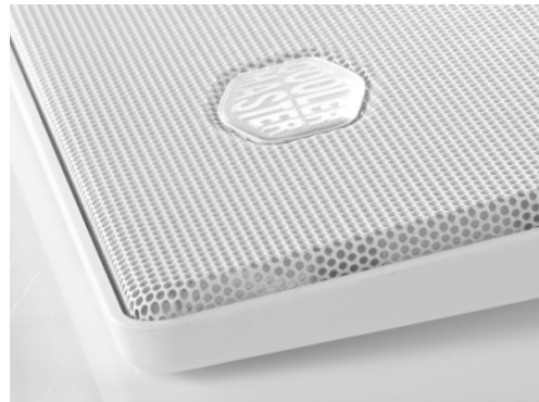
Full Range Mesh

Note: Photos may differ slightly from the final product