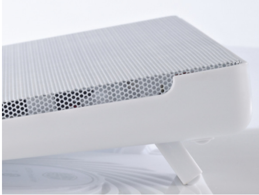
Slim and Lightweight