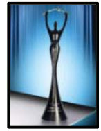
Elektra Award 2005