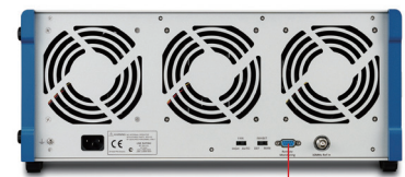
Remote Monitoring Port

The PXIS-2719A has a built-in control board monitors and manages chassis status, including internal temperature, fan speed, and voltages. Using the RS-232 monitoring port, the chassis status information can be exported to another computer for remote management. The control board can also accept commands from the remote system to allow remote power on/off and fan speed control of the PXIS-2719A chassis.