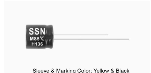
Sleeve & Marking Color: Yellow & Black