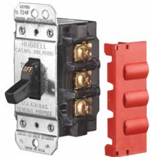
30A, 40A and 50A