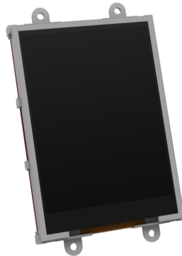
The uLCD-32-PTU Display Module