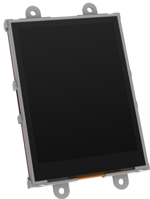
The uLCD-28-PTU Display Module