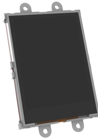
The uLCD-24-PTU Display Module