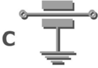
Dimensions mm (inches)