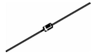
AXIAL LEAD DO35