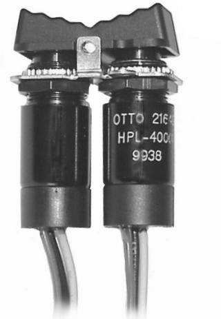
Rocker Assembly Using 2 HPL's