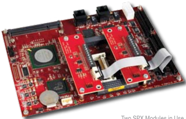
Two SPX Modules in Use