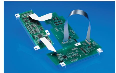
Premo-Flex™ Flat Flex Jumpers