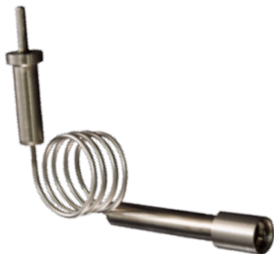
831-002 #12 Assembly for MIL-DTL-38999 Series II, Series 79 and Series 80 Mighty Mouse