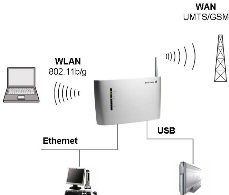
Figure 1 - Overview of Interfaces for the Ericsson W20/W21

The Ericsson W20/W21 provide data capabilities such as data access (e.g. Internet) in the respect that it allows multiple computers to be connected to the terminal using Ethernet or wireless LAN (WLAN).