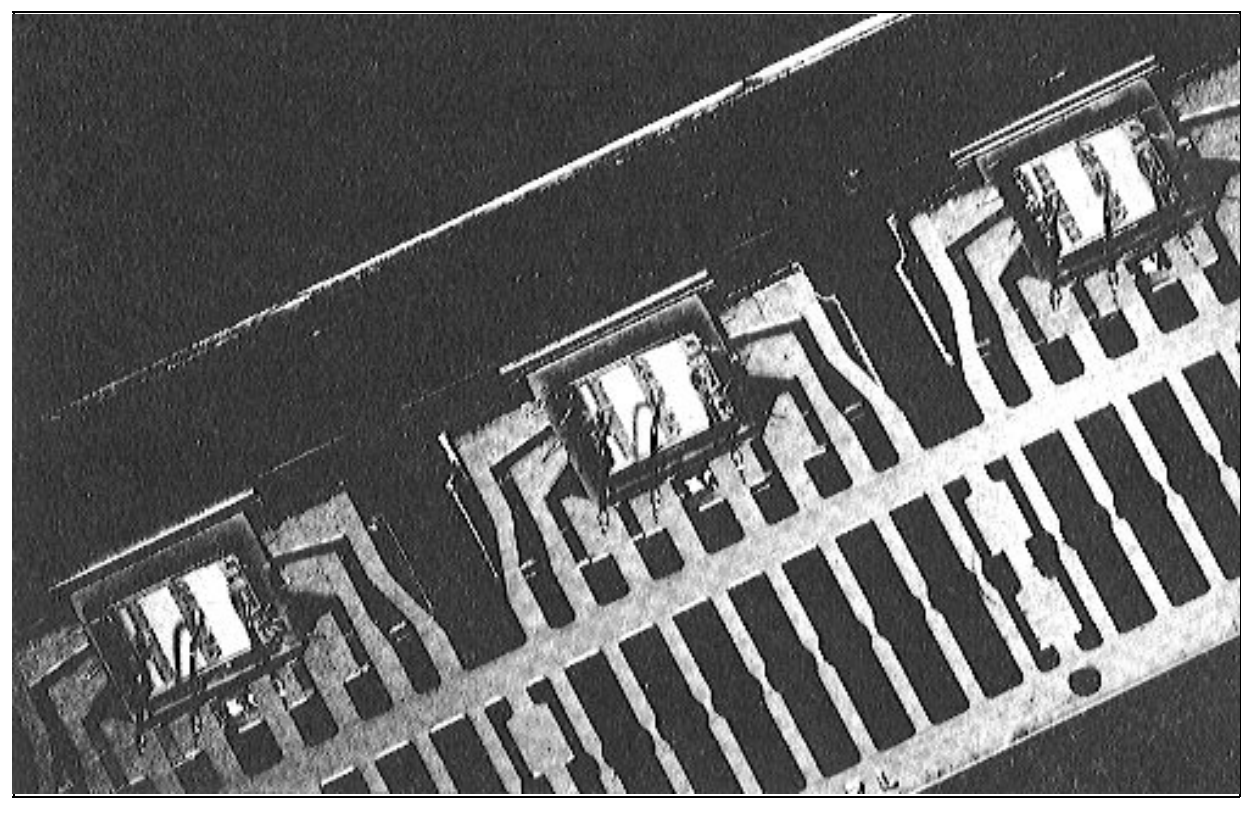
Figure 1: Part of an almost completed strip of integrated circuits utilizing the new mixed bonding technology. The gold and aluminum wires connecting the silicon chip — the small gray rectangle with the gold-plated external connections can be clearly seen.

Increasing the thickness of the gold wires is ruled out partly because of cost, and also because they are too rigid to weld to the surface of the chip without damaging it. It is possible in theory to use two or more gold wires in parallel for each connection but this solution is generally impractical because the large number of bonding pads waste space on the chip (the cost of a silicon chip is proportional to its area), the cost of the wire is excessive and because testing each bond is difficult.