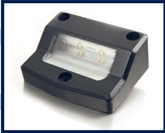
Meets ADA requirement