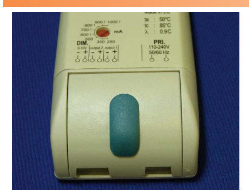
Easily Removable Cover