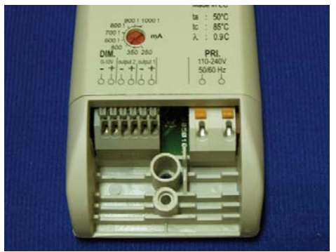
Input and Output Connections