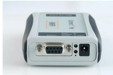
Side view: serial connector, power jack, mode select, SerialNET and power LEDs