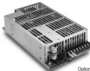
Optional perforated cover shown.