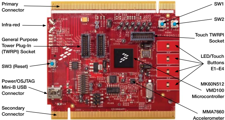
Figure 1: Front Side of TWR-K60N512 Module Not Including TWRPI.