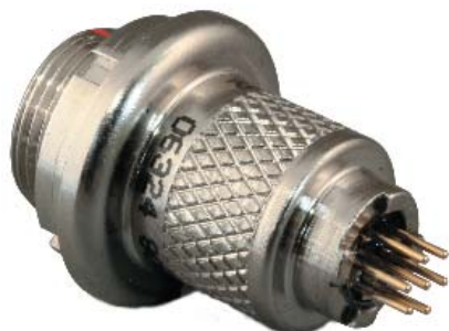
Series 804 Printed Circuit Board Receptacle

Series 804 Receptacles feature factory-installed non-removable contacts. Connectors are backfilled with rigid epoxy for a watertight seal.