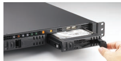
Dual front-accessible SATA HDD trays