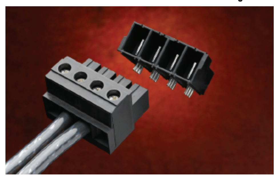
EuroMax Terminal Block without mounting ends

39426 Right-Angle Header With Mounting Ends