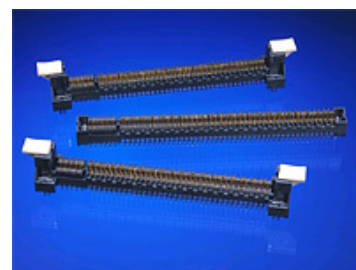
iCool Vertical versions