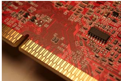
PCBs in industrial/telecommunication equipments