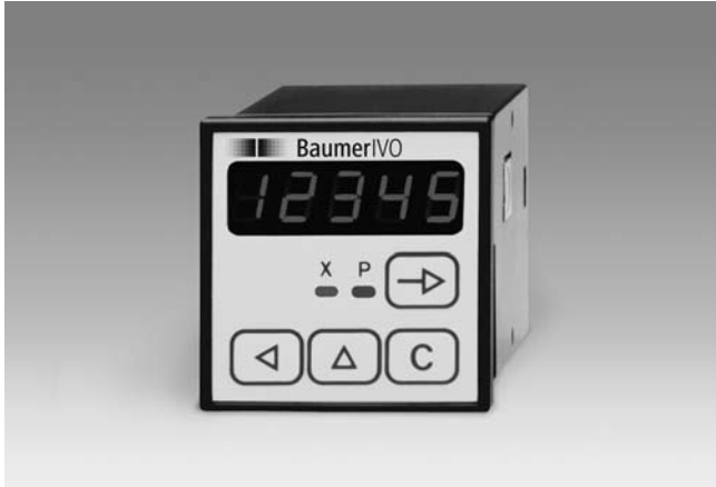
NE210 - LED Preset counter