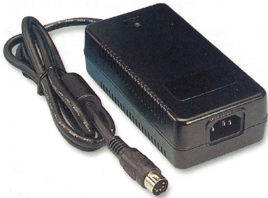
3"W x 5.75"L x 1.7"H