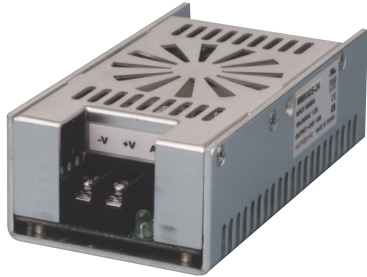
2.5"W x 4.75"L x 1.5"H