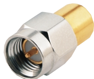
CASE STYLE: LL561 CONNECTOR: SMA MALE