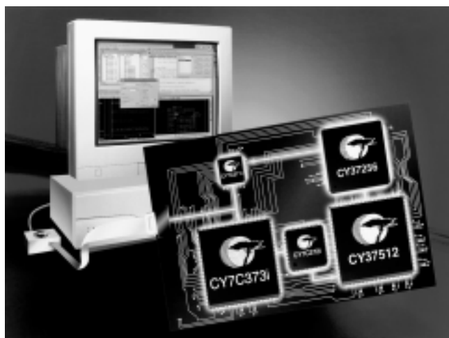
Figure 1. Design and Program with Warp2ISR

for programming. The ISR programmer connects the PC parallel port directly to your board, allowing you to easily reprogram devices when you make design changes. Multiple devices can be programmed in series, and ISR devices are cascable with other IEEE 1149.1 compliant devices for convenient programming.