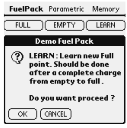
LEARN OPTION Figure 5

The FULL , EMTPY , and LEARN buttons at the top of the screen (Figure 4) are present to allow the user to remove long term error accumulation from the system. Each time the cell is fully discharged, the user should tap the EMTPY button. This will reset the fuel gauge to 0%, the expected empty point for the present operating conditions. Each time the cell is fully charged, the user should tap the FULL button. This resets the fuel gauge to 100% or the expected full point based on present conditions. Finally, the LEARN function will alter the characterization data stored inside the DS2760 to reflect present RAC value. LEARN should be used only after a known good charge from completely empty to completely full has taken place, as these changes will affect the accuracy of the fuel gauge for all future readings. The user should select either LEARN or FULL after a charge, not both; taping both will have a negative effect on the